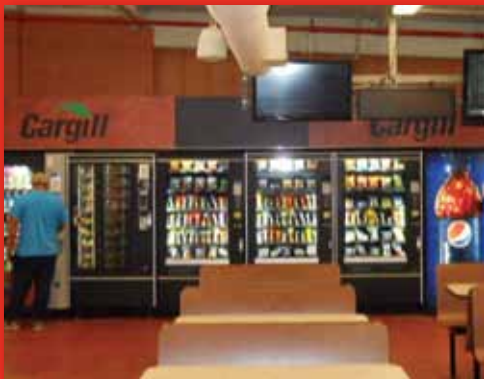
Hot Side Vending and Dining Area