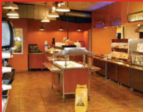
Hot Side Food Service Area