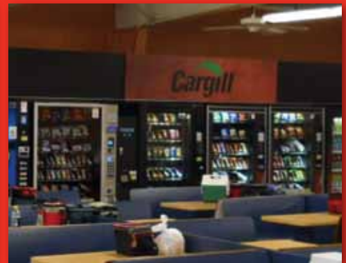
Cold Side Vending and Dining Area