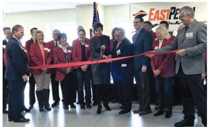
Gov. Kim Reynolds helps cut the ribbon, in support of the new facility.