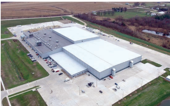
Aerial photo of East Penn facility, Oelwein, IA., courtesy of Multivista.